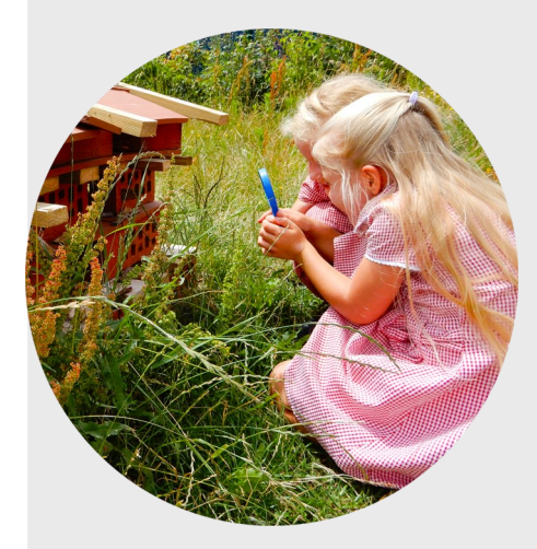
Being self-reflective is essential in encouraging innovation, our Trust is always driven to improve further