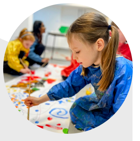
Preserving the unique identity and ethos of all partner schools is essential